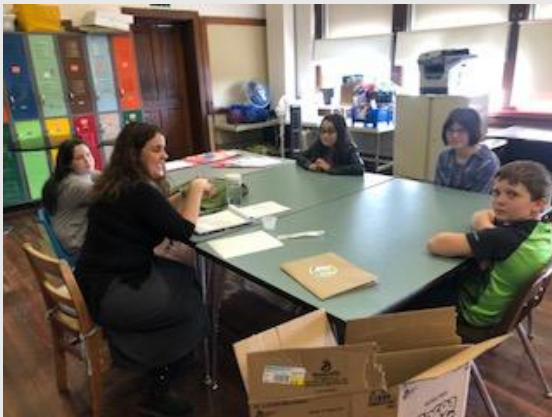
Fourth Grade students collaborate with a community partner during Club Time.