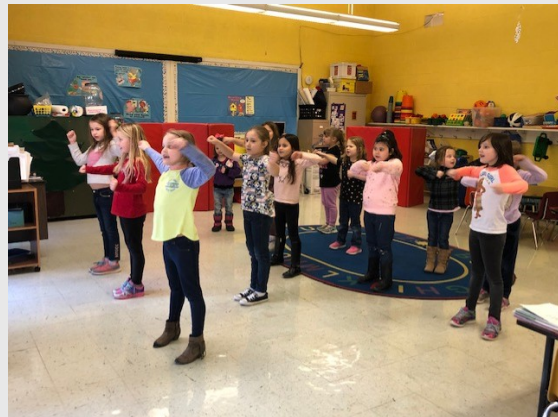
Spirit Club practices cheers to build school spirit during Club Time.